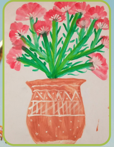
T ARMITHA GRADE 7B