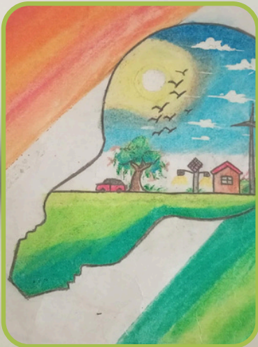
S ASHWIN RAJ GRADE 7C