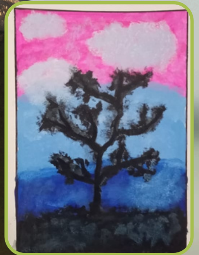
A KOSHAL RAJ GRADE 7A