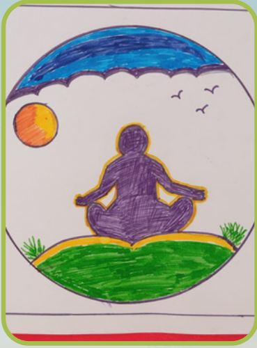
V ANUSHAA GRADE 2B