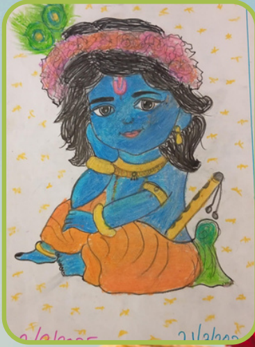
VARMIKA SREE GRADE 7B