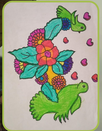
K DHILIPAN GRADE 6A